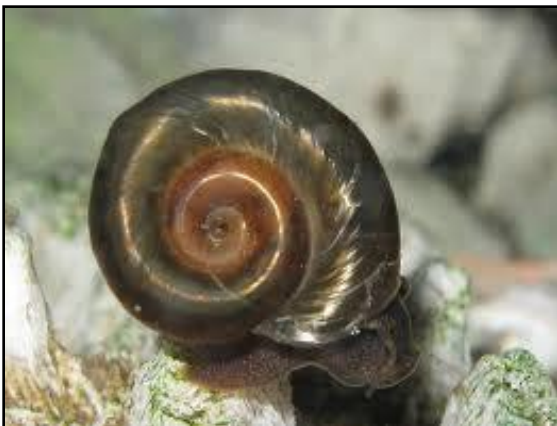
Ramshorn Helisoma Trivolvis

A Ramshorn's whorled shell lays flat, unlike the protruding whorls of the Chinese Mystery Snail.