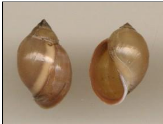
Physella gyrina Physella gyrina

Native snails, like the Physella gyrina , do not have an operculum (trap door).